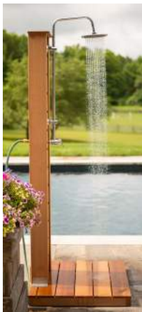
Economy Shower Hardware (Cold water Only)