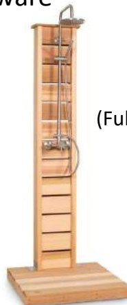
Platinum Shower Hardware (Hot & Cold) (Full stainless steel with hand held shower)